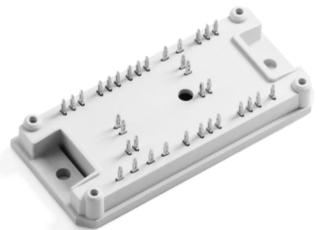
flowPACK 1 H6.5

The flowPACK 1 H6.5 is designed with size, cost and efficiency in mind, making it solution of choice for single-phase solar inverters. The schematics below illustrate how this special topology works: